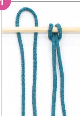
Lark's Head Knot

Rnd 1: *Take 4 cords and make 2 SKs with them *, repeat *-* 23 times more = 24 SK sennits. Make the next round 1 cm / 0.5" from this point.