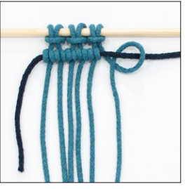
Double Half Hitch = DHH (pic 2)