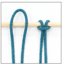
Lark's Head Knot (pic 1)