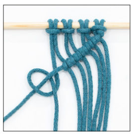
DDHH to the left (pic 4)

Any commercial use of this pattern is prohibited.