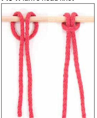
Pic 1: lark's head knot