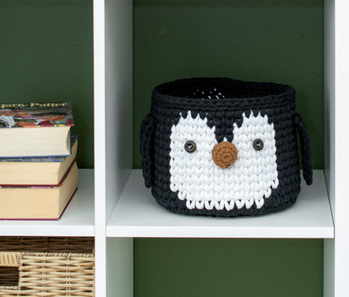
Please check out the Fox and Dog Basket patterns as well.