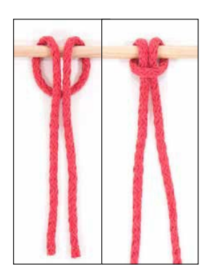
Pic 1: lark's head knot