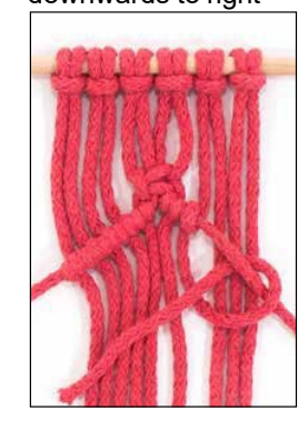
Pic 3: DDHH downwards to right